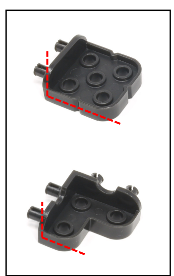
Watch orientation of connectors